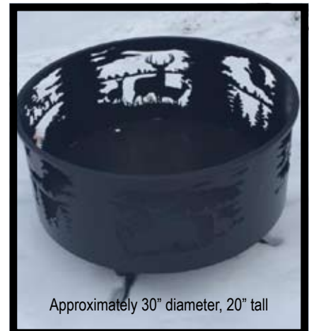
Approximately 30" diameter, 20" tall

Contact senior students/parents to purchase a ticket or fundraiser contact: Kelly Henderson – 515-360-1841