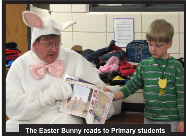
The Easter Bunny reads to Primary students during Reading Night April 3