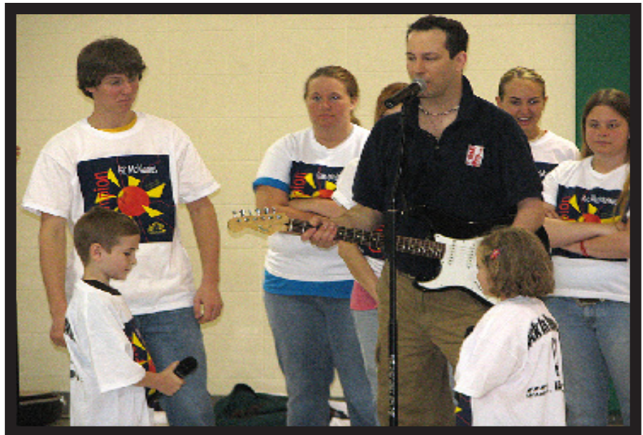
Volunteer high school students interact with elementary students during the Rock-in-Prevention assembly on March 29