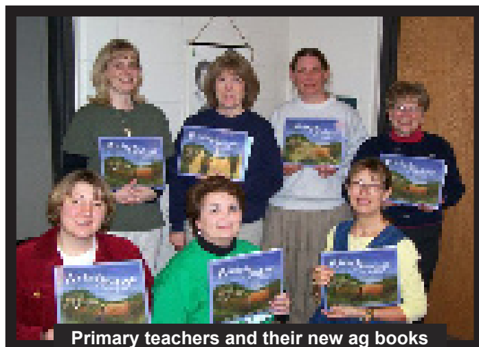
Primary teachers and their new ag books